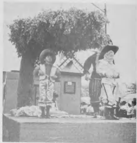
Esso Club Peacock Fantasy Wins Group-of-the-Year Award